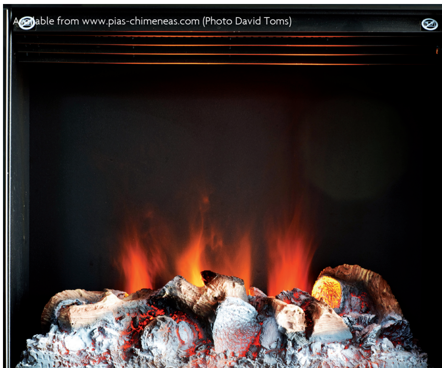
Available from www.pias-chimeneas.com

Modern wood burners and wood burning stoves provide an excellent primary heat source, as the wood burner becomes an attractive focal point as well as being more efficient than a regular open fire. Woodburning stoves also have an added advantage as the fuel is carbon neutral.