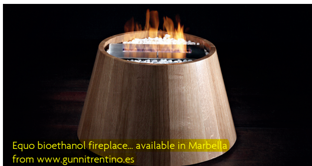
Equo bioethanol fireplace... available in Marbella from www.gunnitrentino.es

With many suitable for outdoor or indoor use, ethanol burners are an increasingly popular – and versatile – option for homeowners. They are eco-friendly, portable and efficient.