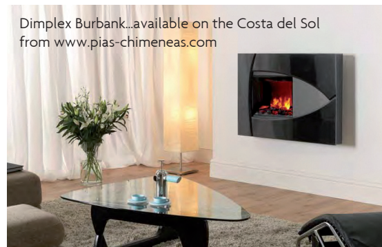
Dimplex Burbank...available on the Costa del Sol from www.pias-chimeneas.com

With many suitable for outdoor or indoor use, ethanol burners are an increasingly popular – and versatile – option for homeowners. They are eco-friendly, portable and efficient.