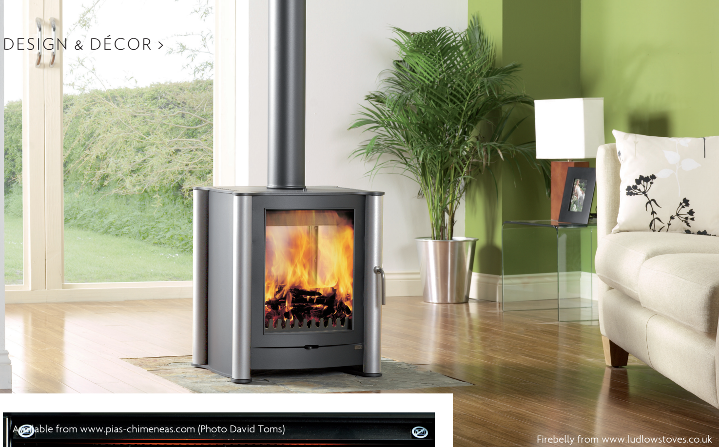
Firebelly from www.ludlowstoves.co.uk